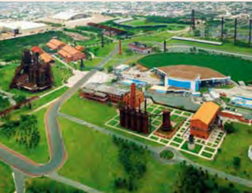
City of Monterey