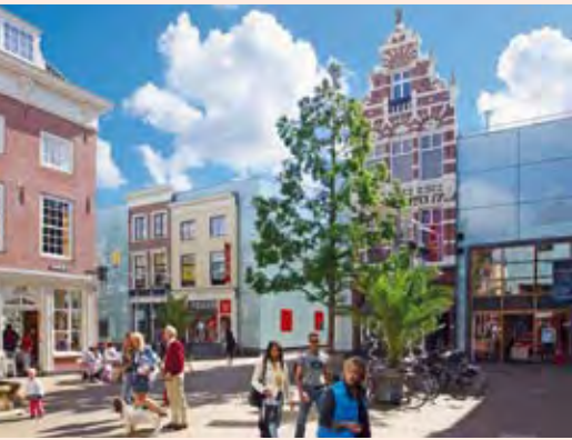
The Hague